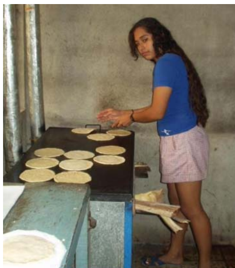
Using Ecostove in Nicaragua

Trees Water and People (TWP) and its partner PROLEÑA/Nicaragua have successfully completed the first phase of the Pro-Tortilla project. The project, which received support from the U.S. Rotary Club and The Ashden Foundation, provided subsidies of 30-58% for 800 Ecostoves for small household businesses in Nicaragua. Of these businesses, generally run by single mothers, 70% make tortillas and the rest make other types of food. The businesses usually operate 6-12 hours per day, cooking over traditional open fire stoves, which results in a hot and smoky working environment, low hygiene levels and high fuel costs. According to a follow up survey, 76% of the 800 businesses which adopted Ecostoves were motivated by a desire to eliminate indoor smoke, 20% to reduce high fuel costs, and 4% to avoid trouble with neighbors due to outside smoke.