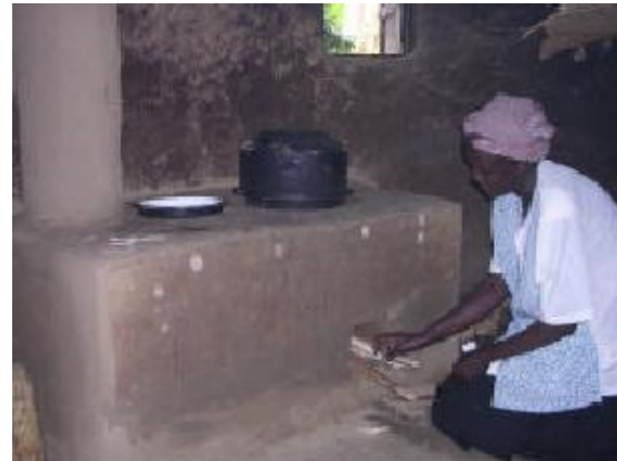
An improved Rocket Lorena Stove

The improved Rocket Lorena stove is built with locally available materials. The stove prevents heat losses and ensures that 90% of the hot gases