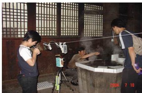
Students setting up monitors near stove

life through integrated utilization of rural renewable energy technologies and products. Indoor air quality monitoring was included in the project for quantifying the effect of rural renewable energy promotion in demonstration sites, as well as, providing accurate and scientific data for environmental improvement evaluation of the Project. This IAQ monitoring will be conducted twice, both pre and post demonstration constructions.