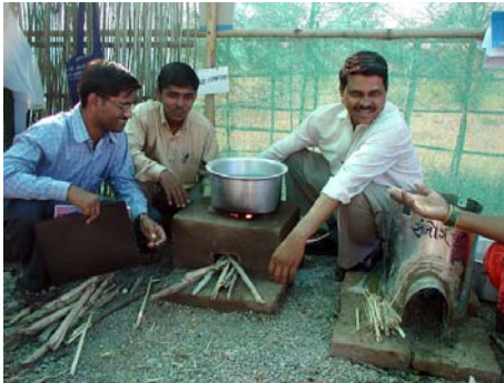
Participants testing stove efficiency in one of the sessions during the camp